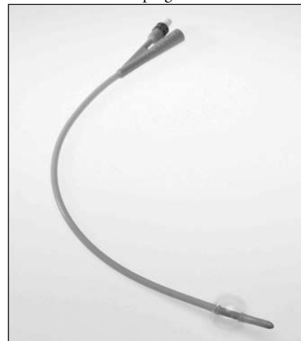
Figure 1. Dover™ Silver Coated Silicone Catheter (Covidien, Clinical Care Division)

Prevention of encrustation and catheter blockage has been largely unsuccessful: hydration has not been effective in encrustation-prone patients; 21 alternative materials for catheter construction, such as hydrogels, have not prevented colonization with urease-producing bacteria or subsequent encrustation in the laboratory or clinical setting; 22,23 and antiseptic- or antimicrobial-impregnated catheters have